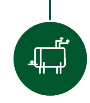
90 Saanich homes converted heating oil tanks to heat pumps